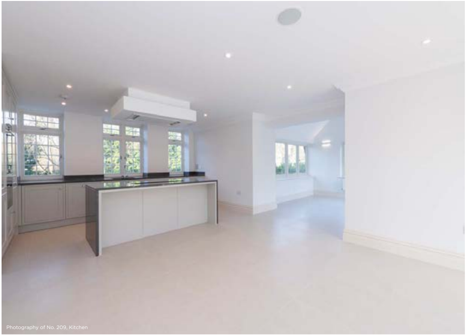
Photography of No. 209, Kitchen