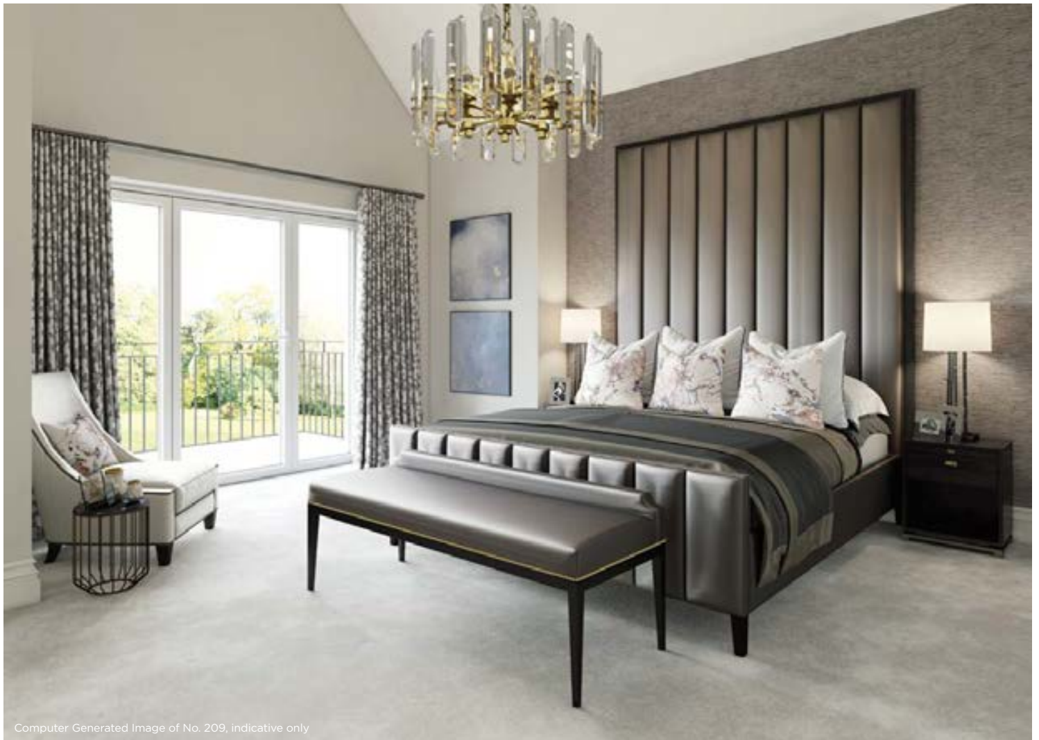
Computer Generated Image of No. 209, indicative only