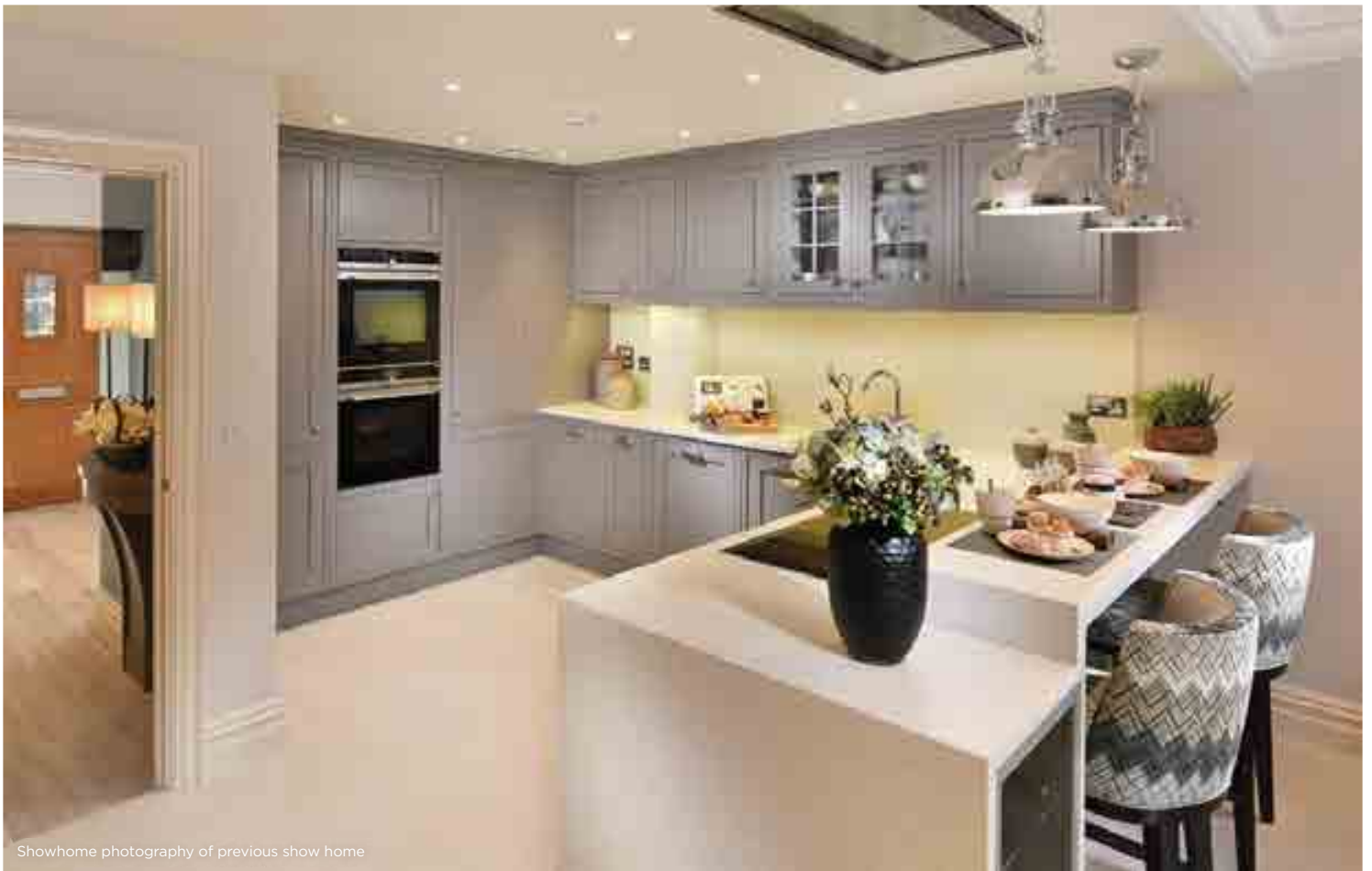
Showhome photography of previous show home