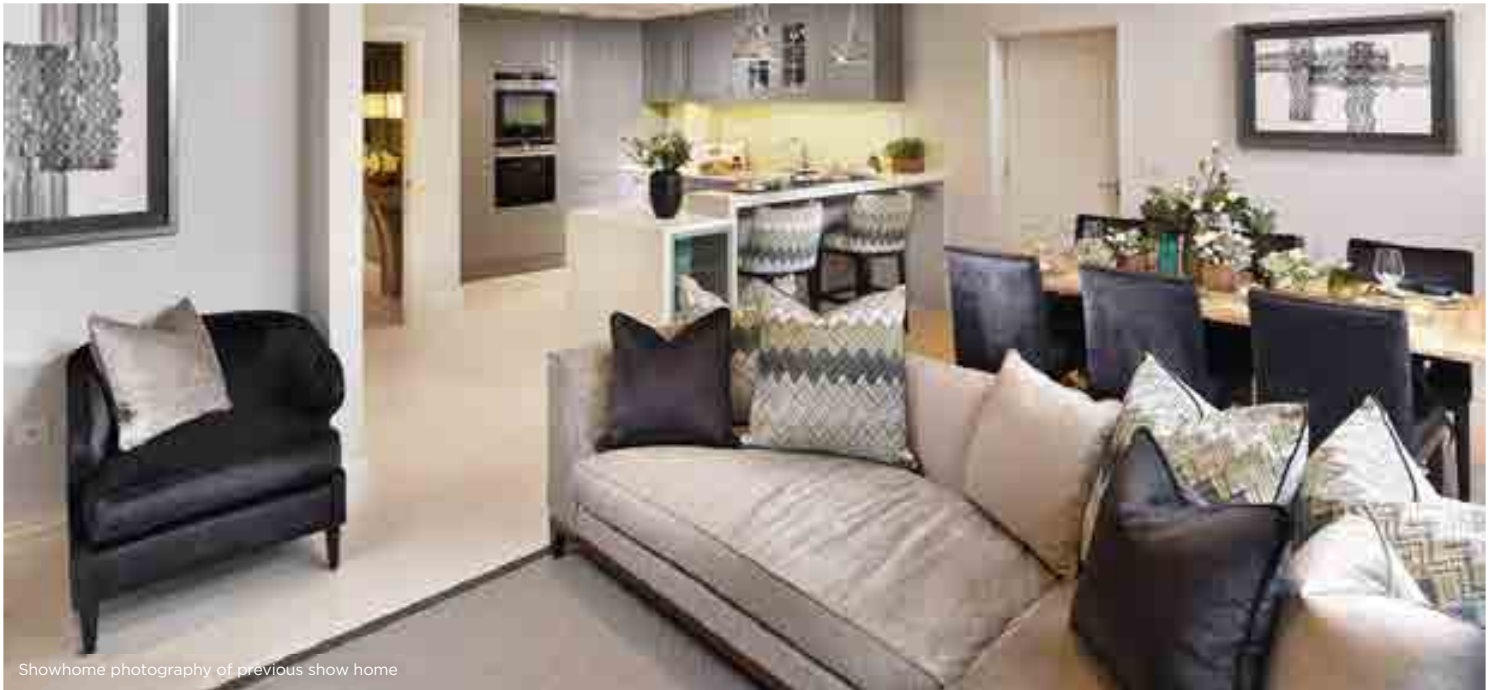
Showhome photography of previous show home