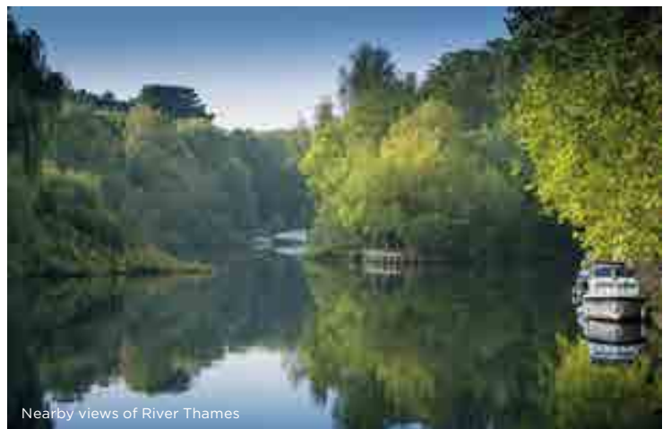
Nearby views of River Thames