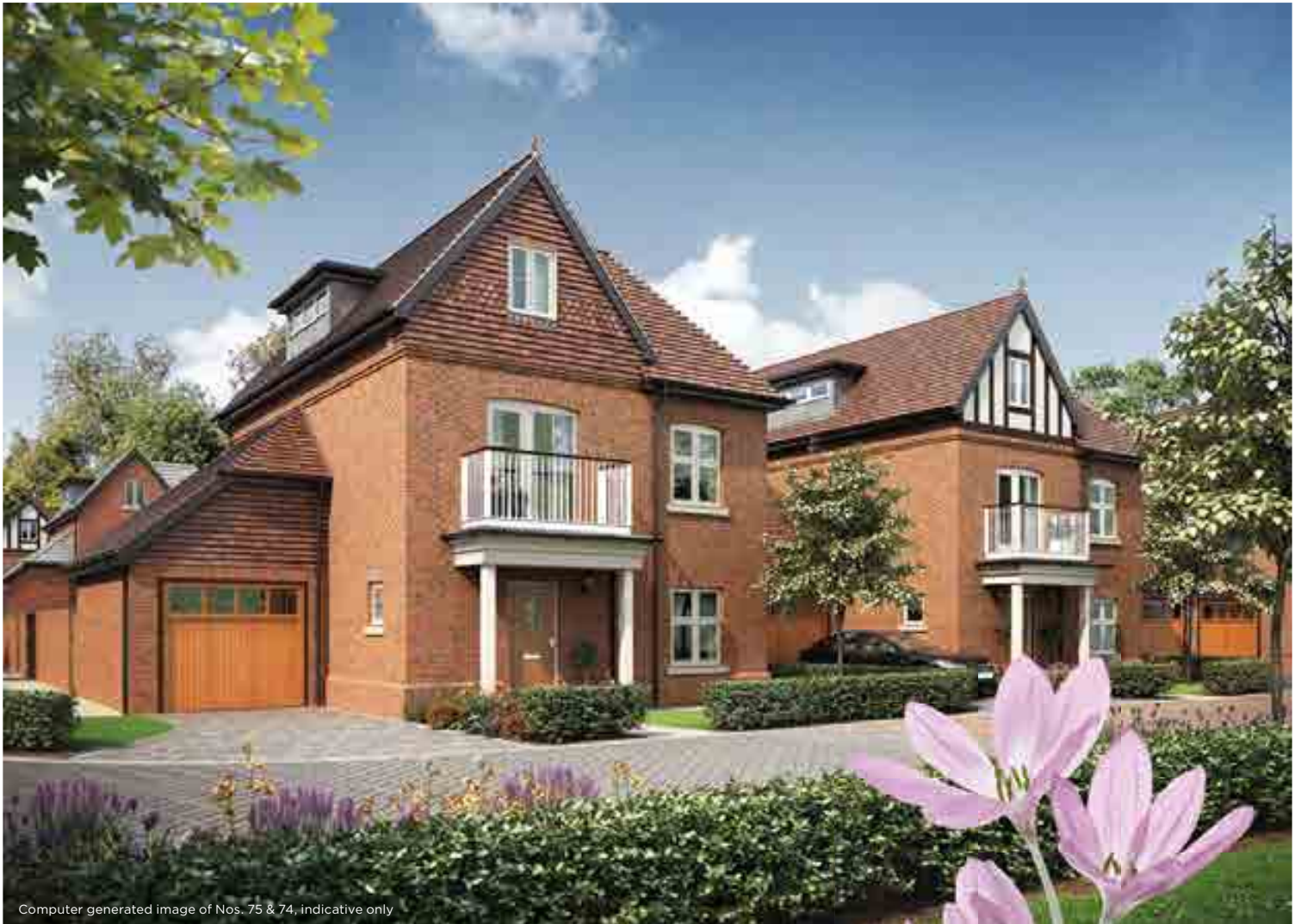
Computer generated image of Nos. 75 & 74, indicative only

Nos. 74*, 75*, 76, 77, 80*, 81*, 82 & 84