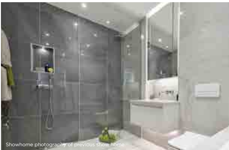
Showhome photography of previous show home