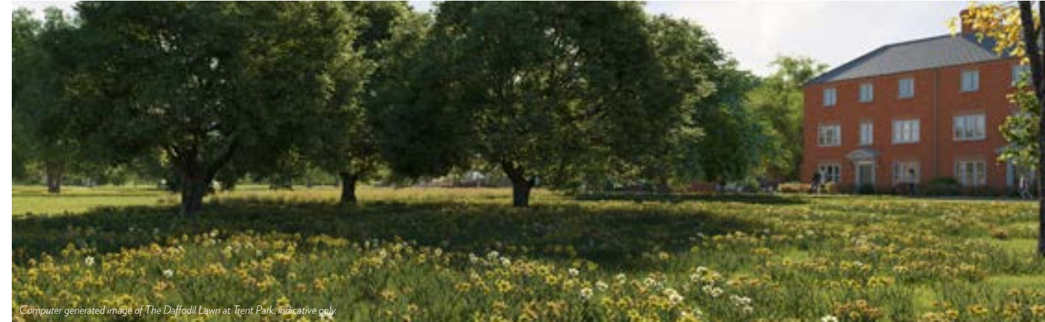
Computer generated image of The Daffodil Lawn at Trent Park, indicative only.

All Berkeley developments are designed to permanently enhance the neighbourhood in which they are located through excellence in design, sensitive landscaping, sympathetic restoration and impeccable standards of sustainability.