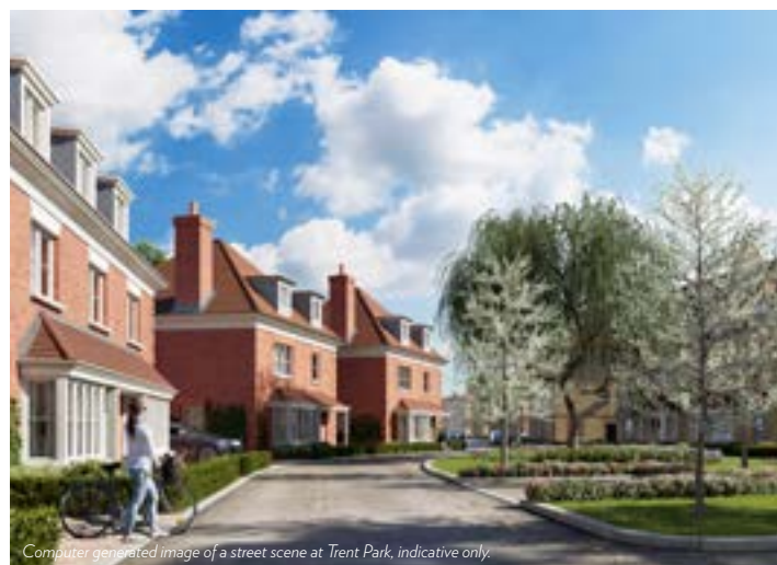
Computer generated image of a street scene at Trent Park, indicative only.