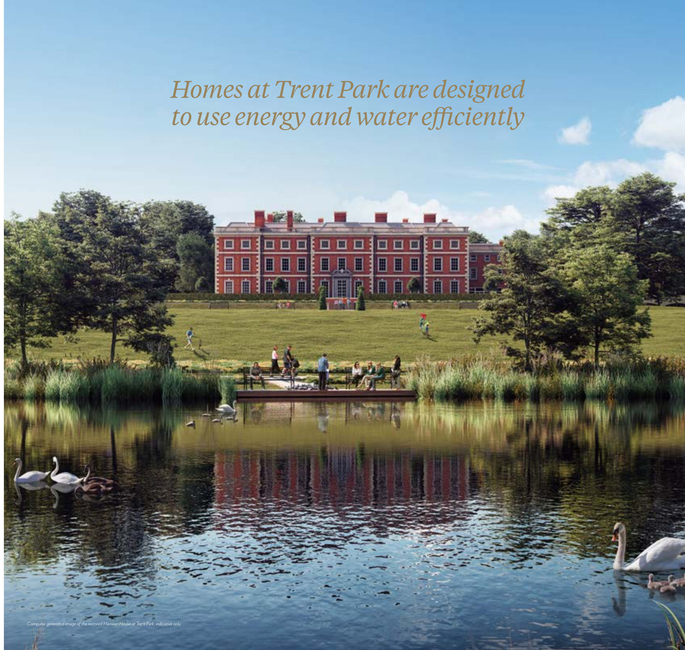
Computer generated image of the restored Mansion House at Trent Park, indicative only.

Homes at Trent Park are designed to use energy and water efficiently